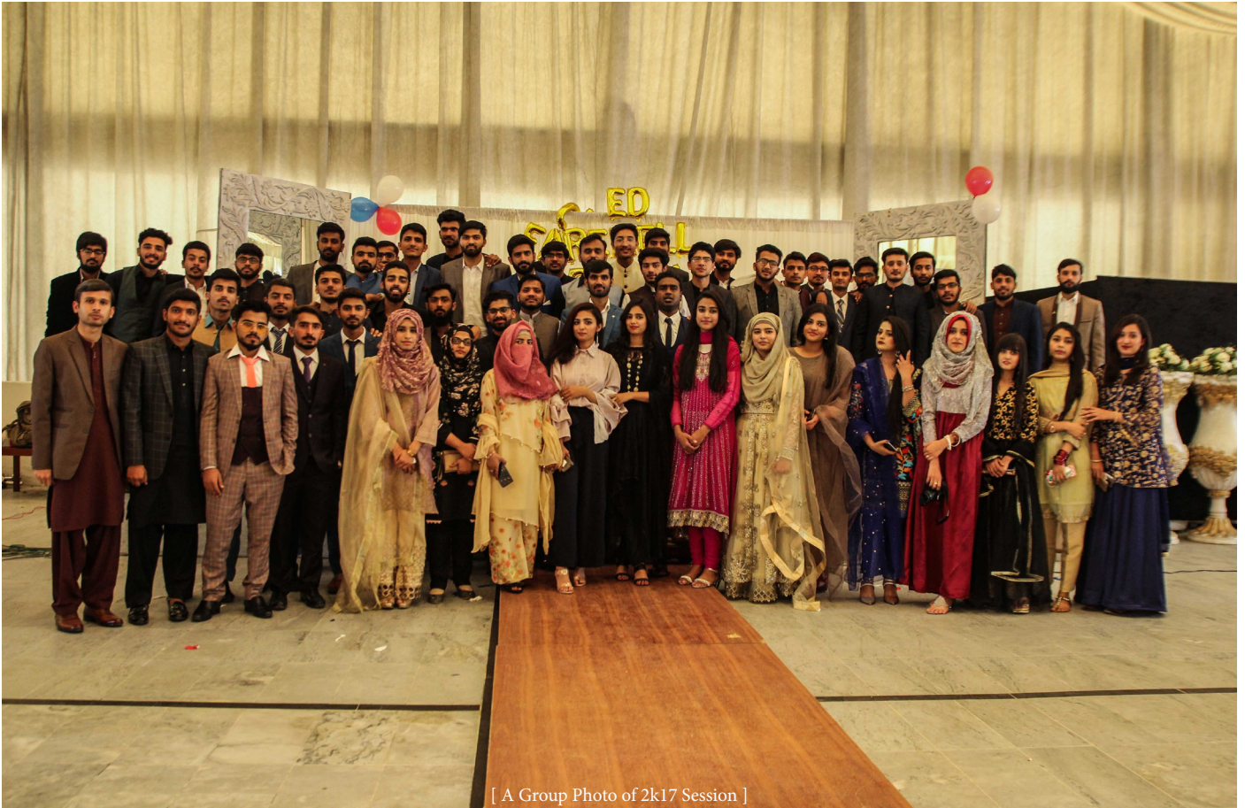
[ A Group Photo of 2k17 Session ]

We stand before you to pay the last appreciation and to say the final goodbye, to our dear students. It can be very hard to say "Goodbye" but there are so many meanings to it. It can mean a "forever goodbye" or "see you next time." Maybe this goodbye is forever for some of you and maybe some will be seen next time. Although it is very hard to say forever goodbye and that may hurt your feelings too but things have to end after completion. So is the case with your Computer Engineering studies that now comes to an end.