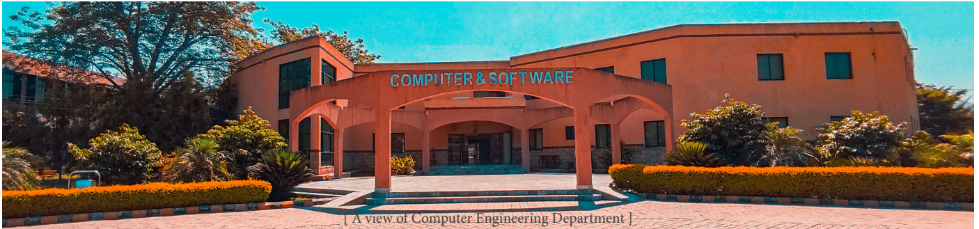
[ A view of Computer Engineering Department ]