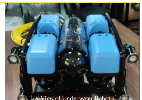
[ A View of Underwater Robot ]

CPED based Swarm robotics lab purchased Underwater robots for the planned projects. Swarm Robotics Lab is one of the HEC funded labs under the National Centre for Robotics and Automation (NCRA). NCRA is a consortia of 11 labs over 13 universities of Pakistan with its headquarters at NUST College of E&ME. NCRA has been inaugurated in NUST College of E&ME by Prof. Ahsan Iqbal (Minister Planning, Development and Reforms) on May23, 2018. Swarm Robotics lab @ UET Taxila is having funding of approximately 79 Million PKR.